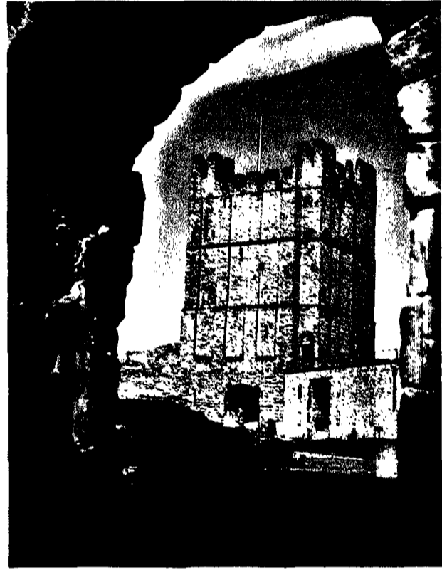
Richmond Castle Yorkshire – an early Norman castle.