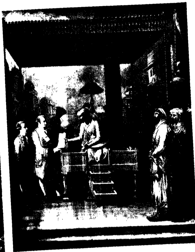
Robert Clive and the Mughal Emperor Shah Alam.