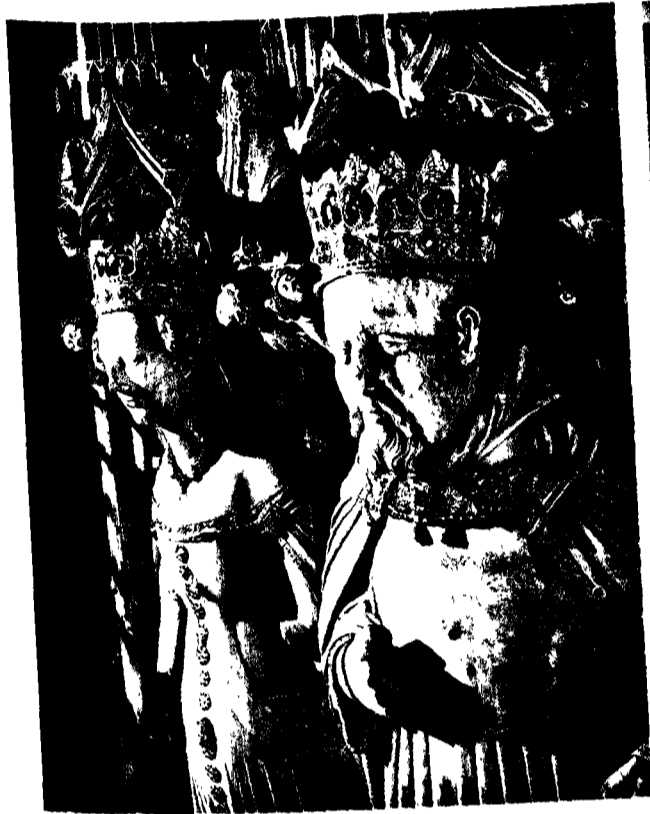
Henry IV and his wife Joan of Navarre.