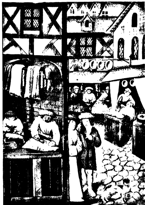
Medieval commerce. A 15th century market.