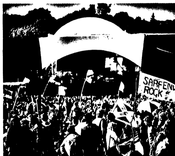
Pilgrims at the shrine. A Rock festival, 1980s.