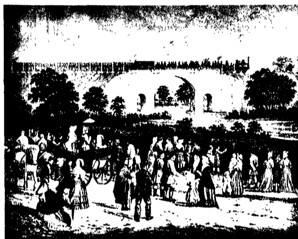
Transport revolution: The advent of railways.