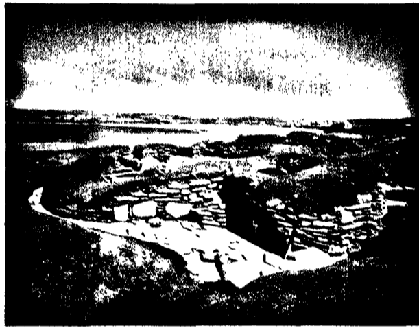
Skara Brae – a Neolithic settlement on Mainland, Orkney.